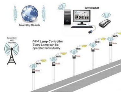
Fig 1. Street light controller with wireless technology

Thus message is decide whether the street light should ON/OFF by the help of gsm and microcontroller circuit It enables regulate their communication strategies according to dynamically changing network environment. Street lights should work on the systematic manner by the help of circuit and huge reduction in power consumption on whole around the